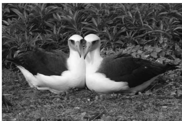
Figure 1. A female-female Laysan albatross pair at Kaena Point.

incubation duties. All females in these pairs were unrelated ( p > 0.05 for all pairwise comparisons). Female-female pairs were also present in Laysan albatross on Kauai ( N = 18 ).